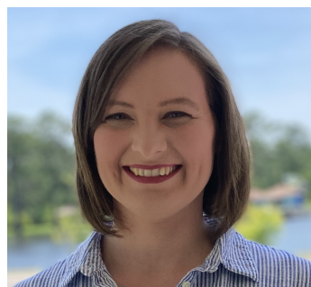
Bri Lee Proposal Writer